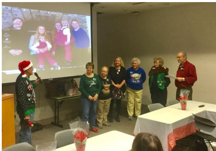
(Above) Installation of Officers